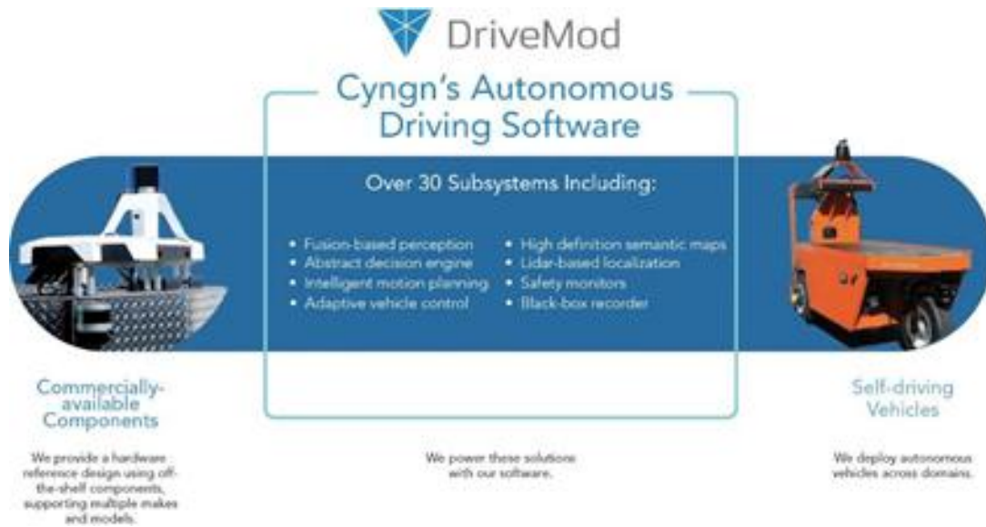
Figure 5: The major subsystems that make up Cyngn's autonomous vehicle technology (DriveMod)

We built DriveMod as a modular software product that is compatible with various sensor and computer hardware components that are widely used throughout the autonomous vehicle industry. Our software combined with sensors and components from industry leading technology providers covers the end-to-end requirements that enable vehicles to operate autonomously with leading-edge technology. The modularity of DriveMod allows our AV technology to be compatible across vehicle platforms as well as indoor and outdoor environments. DriveMod can be retrofitted to existing vehicle assets or integrated into a manufacturing partner's vehicles at assembly, providing accessible options for our customers to integrate leading-edge technology whether their AV adoption strategies are evolutionary or revolutionary.