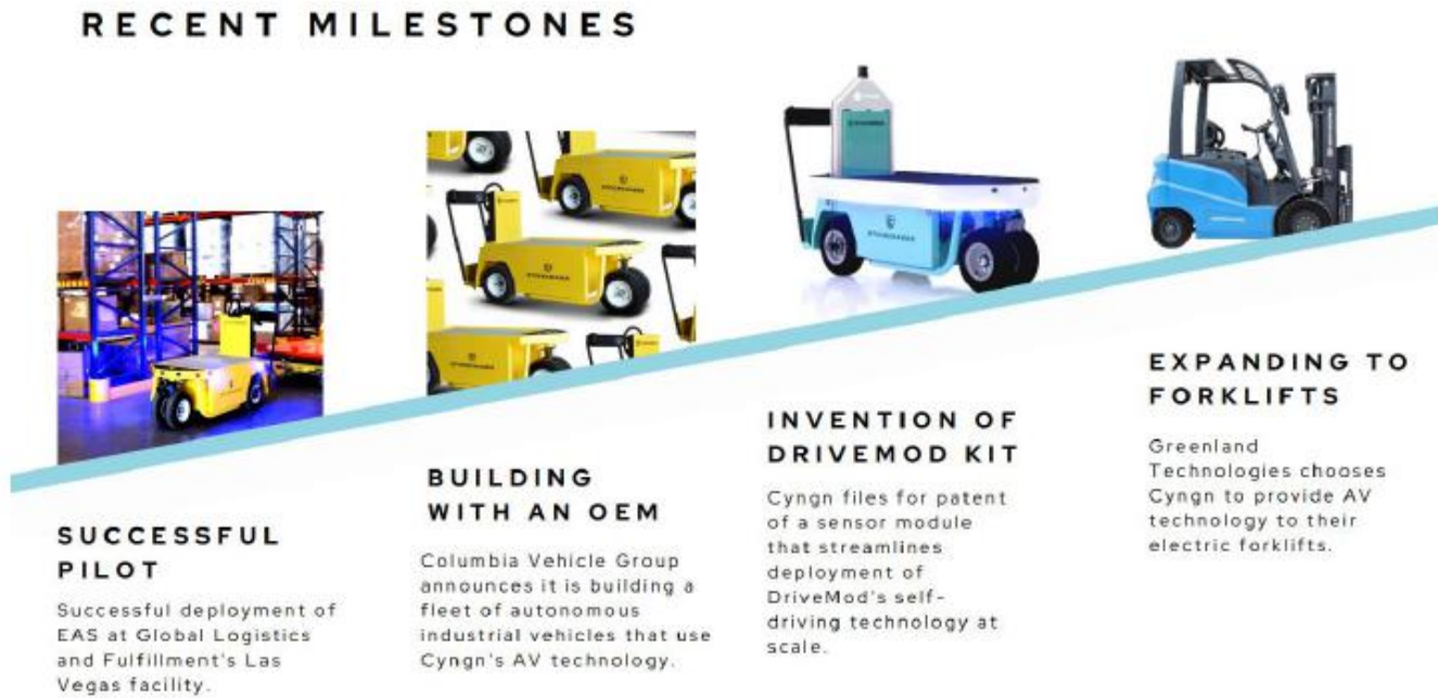
Figure 0: Summary of recent Cyngn milestones

Our recent progress contributes to the validation of EAS with OEM partners and end customers. We also continue to build upon our ability to scale our products and generate novel technological developments. See figure below for recent highlights: