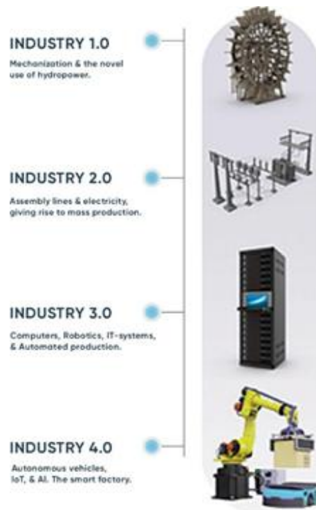
Figure 1: Illustration of the progression from Industry 1.0 to Industry 4.0.

Industrial automation is broadly understood to consist of a wide range of technology solutions that provide varying levels of automation for critical software control systems and industrial equipment. These components are essential to the operations and growth of global markets such as manufacturing, distribution, transportation, construction, and mining. The relatively controlled and pre-defined operational environments industrial companies operate in are what make them such a strong opportunity for companies looking to develop automation solutions, but enhanced product capabilities will be required to achieve the promise of Industry 4.0 — capabilities that will be created by technological advancements in AI/ML, robotics, connectivity, mapping, and interoperability.