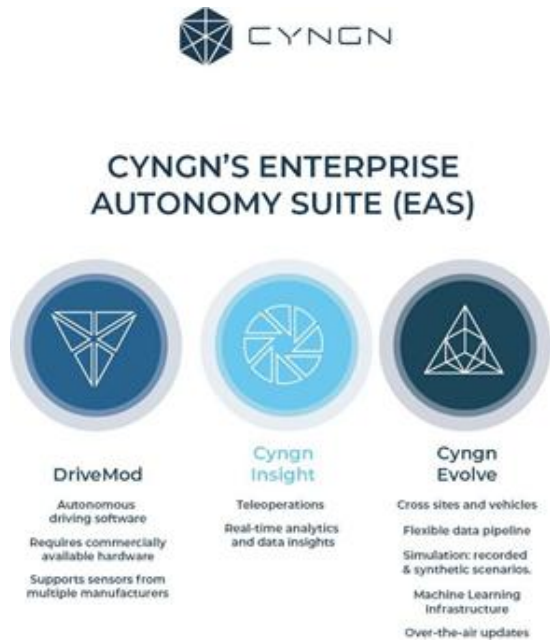
Figure 2: The core components that make up our EAS product offering. EAS is currently available as a private beta release to select customers.

Some companies manufacture standard industrial vehicles then integrate industrial automation software for rigid tasks. Others develop new vehicle platforms to enable more advanced automation capabilities, limiting the AV technology to a narrow use case. We develop an advanced autonomous vehicle software, DriveMod, for industrial vehicles. DriveMod is a component of EAS that is operationally expansive, vehicle agnostic, and compatible with indoor and outdoor environments. EAS centers around DriveMod’s on-vehicle AV software and is supported by our Cyngn Insight and Cyngn Evolve technology and tools.