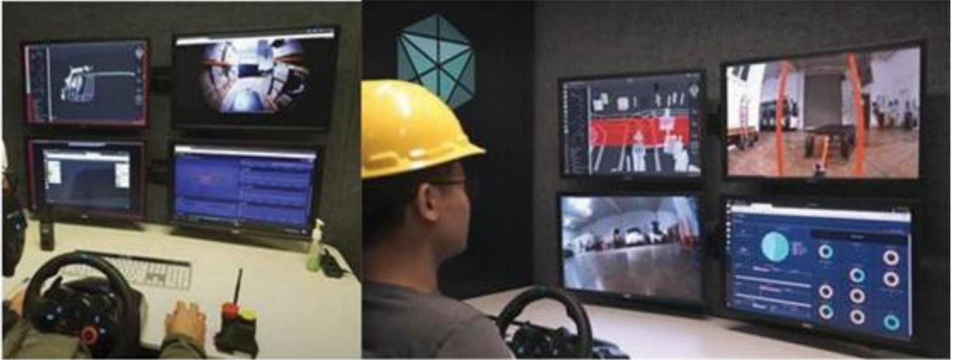
Figure 6: An operator uses the Cyngn Insight control center to operate vehicles remotely

Cyngn Insight is the customer-facing tool suite for managing AV fleets and aggregating data to extract business insights. Analytics dashboards surface data about the system's status, vehicle telemetry, and performance metrics. Cyngn Insight also provides tools to switch between autonomous, manual, and remote operation when required. This flexibility allows customers to use the autonomous capabilities of the system in a way that is tailored to their own operational environment. Customers can choose when to operate their DriveMod-powered vehicles autonomously and when to have human operators operate the vehicles manually or remotely based on their own business needs. When combined, these capabilities and tools make up the Cyngn Insight intelligent control center that enables flexible fleet management from any location.