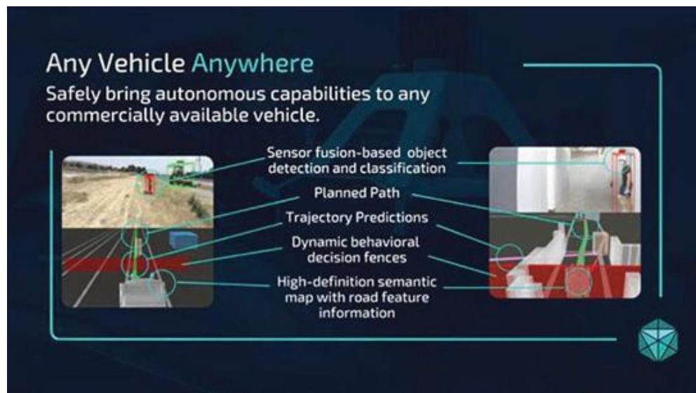
Figure 4: Illustration of DriveMod's ability to utilize key subsystems across multiple environments and vehicle platforms (left: off-road utility vehicle; right: indoor material handling vehicle).