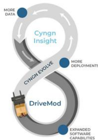
Figure 3: The EAS product flywheel

Our EAS combines core autonomous vehicle technology with a suite of tools and products that strengthen the ties between industrial business operations and the positive network effects that underpin the relationship between data and AVs. DriveMod uses data from advanced sensors to navigate AVs, creating a de facto mechanism for rich data collection. Vehicles equipped with DriveMod provide the means for us to collect data then organize, analyze, and expose customers to novel insights. This makes the data collected during vehicle operation a new type of asset that adopters of AV technology can take advantage of. Data can be stored in cloud or on-premises servers, according to customer requirements. We intend to have our customers own the data collected at their facilities and for Cyngn to have the rights to use that data for certain purposes, such as testing simulation and development. These data assets present a new opportunity to reveal previously unknown insights about day-to-day operational processes that impact safety, efficiency, vehicle maintenance, and growth.